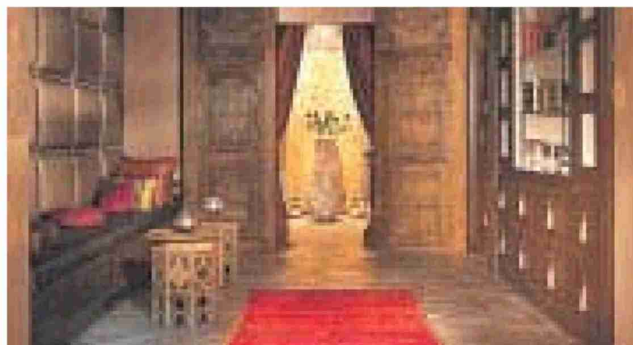
ATMOSPHERIC: The Spa whisks you from Pimlico to the depths of Marrakech