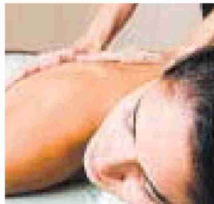
CHILL OUT: Enjoy a relaxing massage