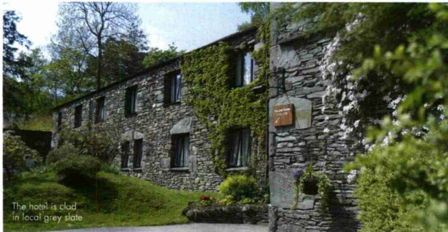
The hotel is clad in local grey slate