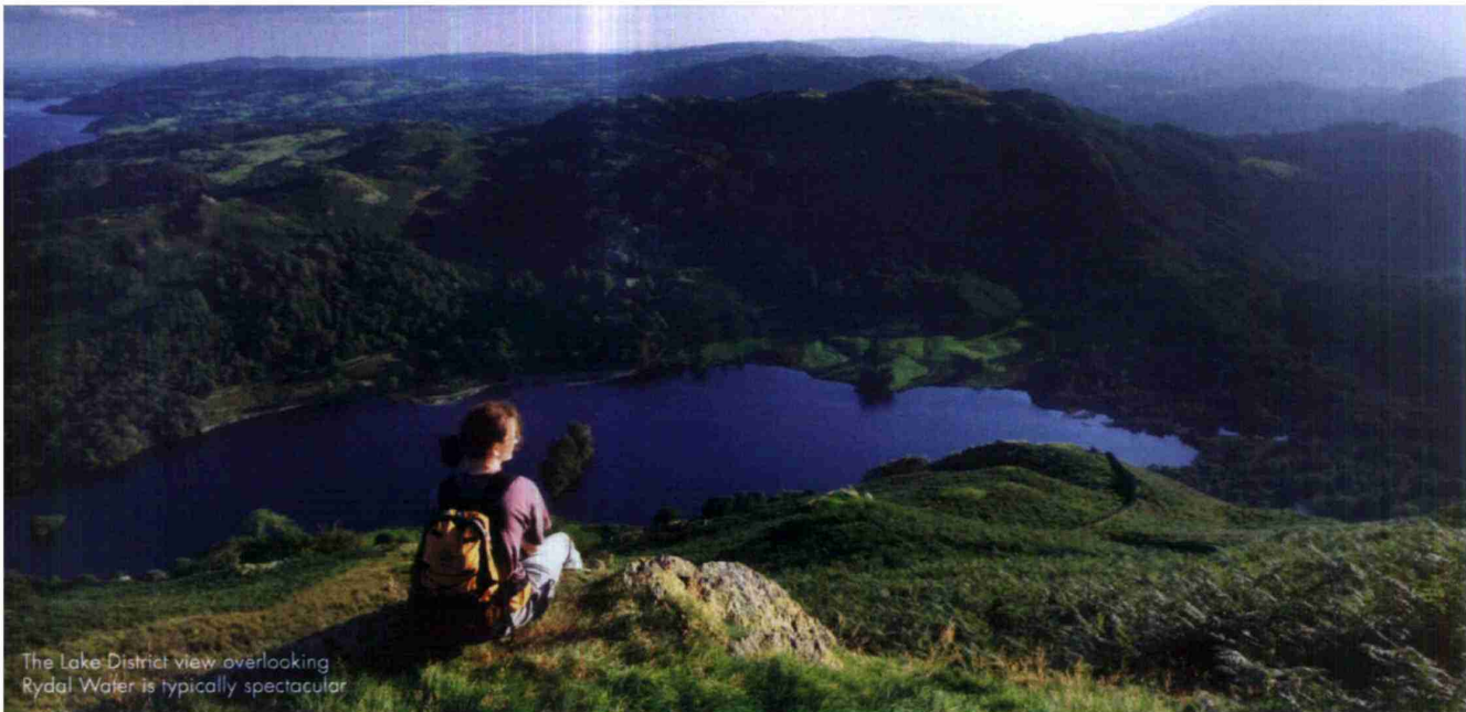
The Lake District view overlooking Rydal Water is typically spectacular

Bed down in a tree-house surrounded by protected woodland. This company offers great forest retreats across the UK in rustic-style cabins that are luxuriously decorated. Cabins in Yorkshire or Cornwall are built into the trees, accessed by a bridge. From £179 for a three-night weekend ( forestholidays.co.uk ; 0845 130 8225).