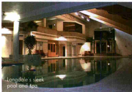
Langdale's sleek pool and spa